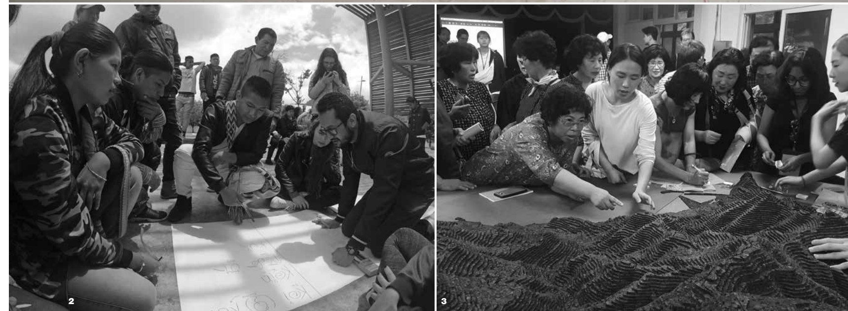
1 Installation at the Dr. Bhau Daji Lad Mumbai City Museum, Mumbai 2017. Visitors were asked to pin a thread connecting their native village to their neighbourhood in Mumbai. These connected maps show the dense network of connections that exists between Indian cities and villages. 2 Workshop with an indigenous community in the outskirts of Bogotá on the improvement of their settlement. 3 urbz is working with local governments in South Korea to come up with strategies for the economic and urban development of rural localities, such as the island of Ulleungdo, on the East Sea between Korea and Japan.