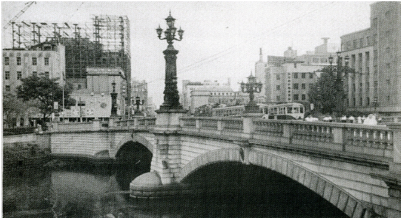
1. Nihonbashi Bridge before the expressway