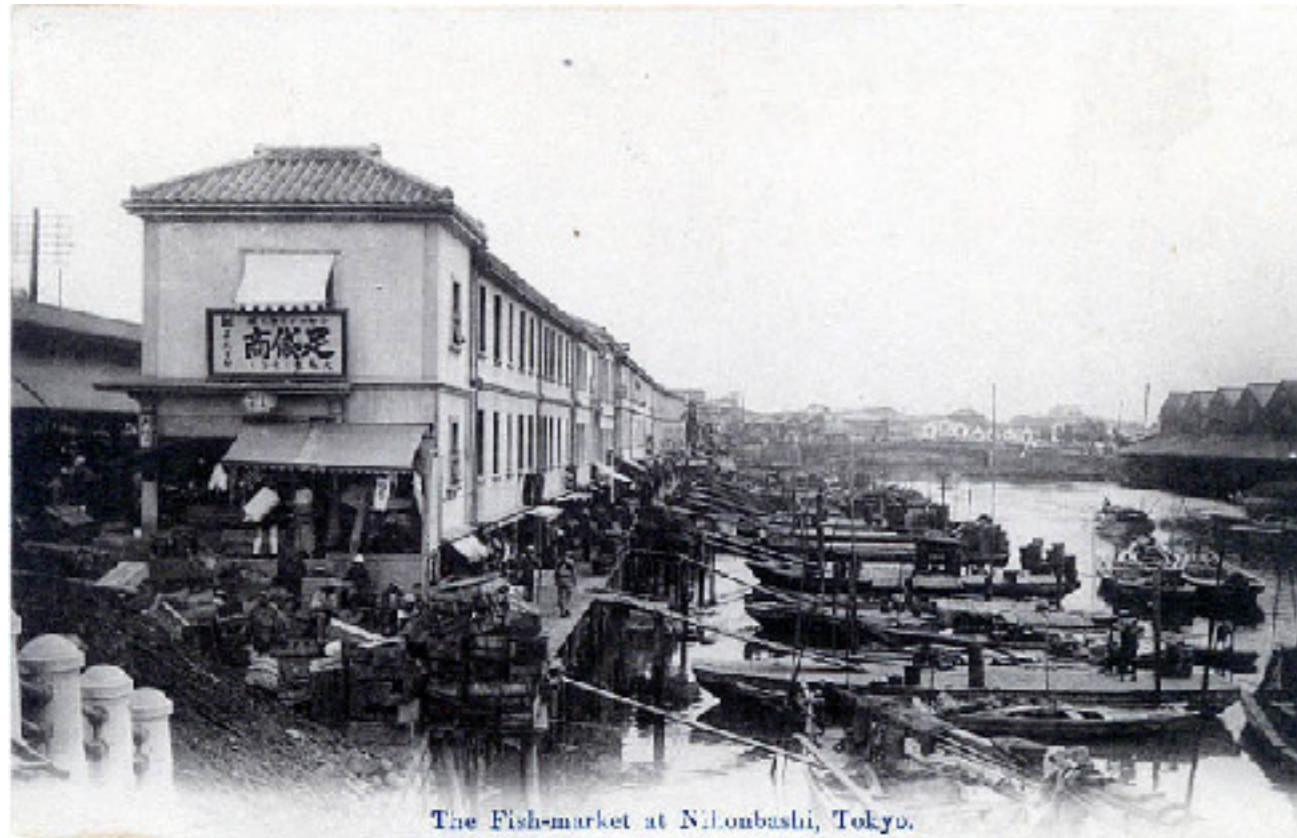
The Fish-market at Nihonbashi, Tokyo.